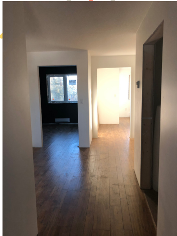
Unit 4, upstairs. Almost complete!